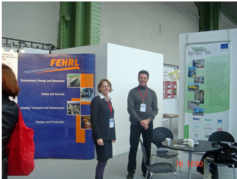
Picture 2 European Cities of Science November 14-16, 2008

The SPENS poster was presented at several occasions.